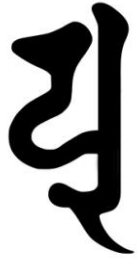
Seed Syllable YU

Mudra: Mahamayuri Mudra (Internal Handclasp Mudra): First, form the internal handclasp mudra in front of your chest, then bring the two little fingers and thumbs close together as illustrated in the picture on the left. The thumbs represent the head of the peacock, the little fingers represent the tail feathers of the peacock, and the middle part represents the body of the peacock.